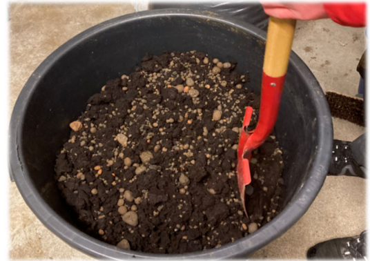
Algae fiber mixed with Leca® clay aggregates.

Leca has several potential benefits, but our rationale for using it is because it is a very stable material and will not add anything other than structure to our composting experiments. Other bulking agents, such as wood chips and straw, add carbon and contain cellulose and lignin, both of which are known building blocks of humic substances. Normally, this is positive, but in our case we want to eliminate non-marine sources of these. Another benefit of Leca is that it provides a porous surface area for bacteria and other microorganisms on which to live. Applying compost containing Leca to soil adds structure, porosity, and contributes to regulating soil moisture content.