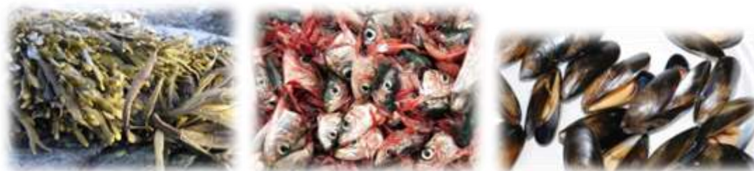
Figure 1: Raw materials from BlueBio resources